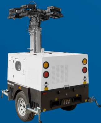
URBAN RANGE PAGE 8