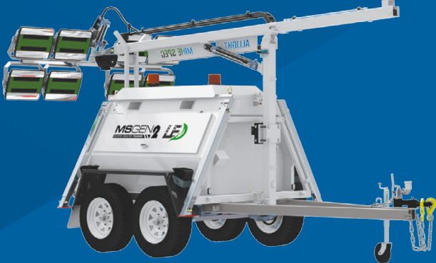
MINESPEC LED RANGE PAGE 10