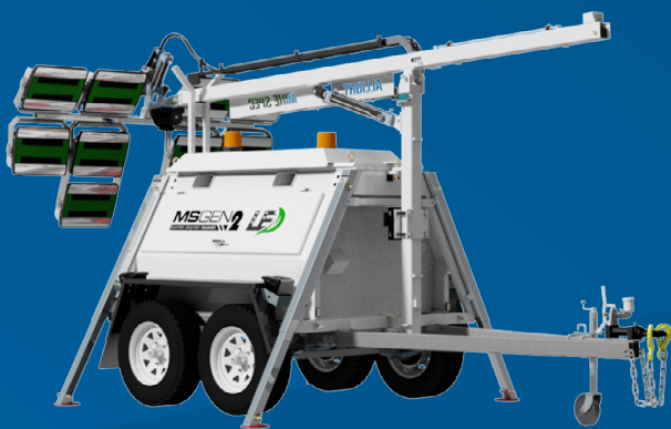
▶ LIGHT TOWERS