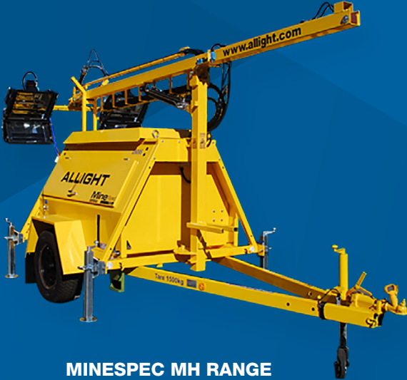
MINESPEC MH RANGE PAGE 12